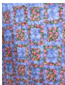
FLOWERS IN THE FIELD Opal Woody 61.5 x 78.5

Below are the quilts for our fundraiser: