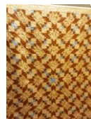
FRACTURED CRYSTALS Carol Campbell, Patsy Caraway Dawn LeDuc 65.5 x 83