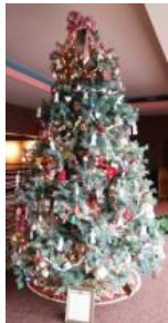
Christmas tree at CoMMA which was decorated by Guild Members.